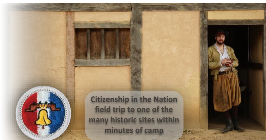
Citizenship in the Nation field trip to one of the many historic sites within minutes of camp