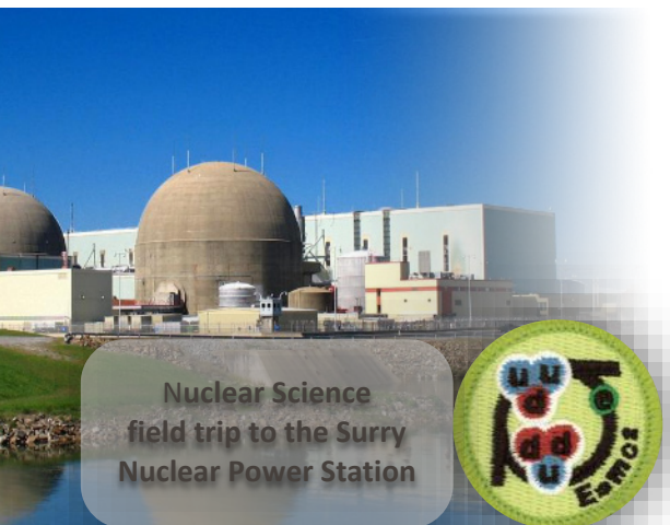
Nuclear Science field trip to the Surry Nuclear Power Station