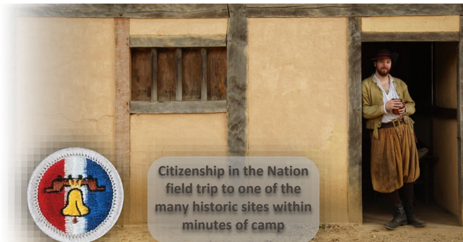
Citizenship in the Nation field trip to one of the many historic sites within minutes of camp