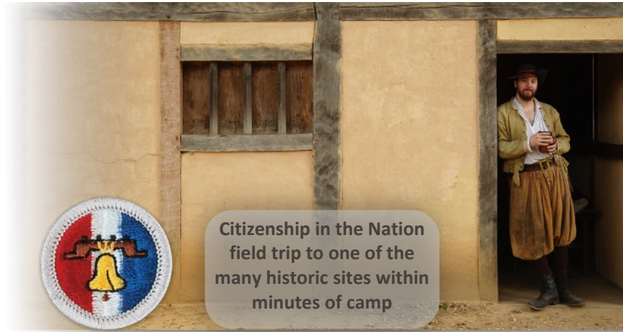
Citizenship in the Nation field trip to one of the many historic sites within minutes of camp